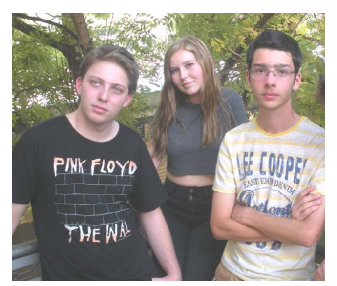
Duval students in the four-member band, Bohemia